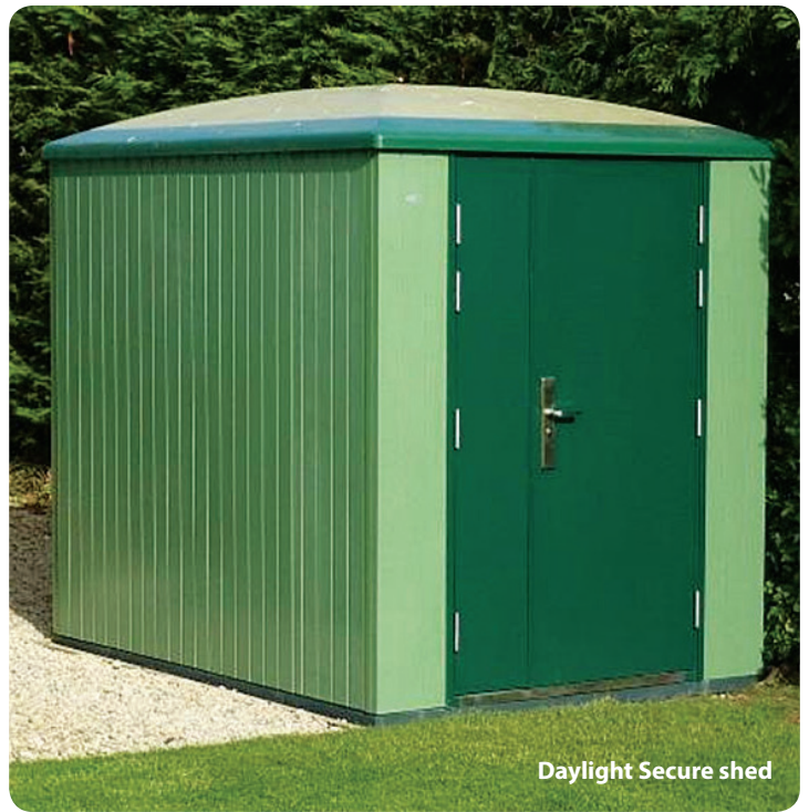
Daylight Secure shed