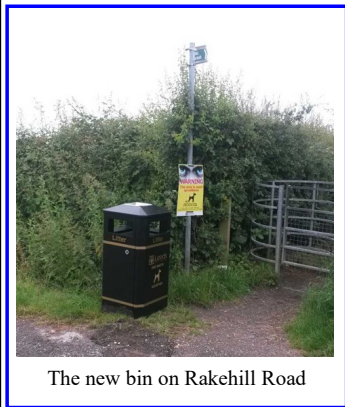
The new bin on Rakehill Road

Twelve months ago, this newsletter had a centre-page spread on the problems of dog-fouling. We were keen to hear from dog owners to see if we could make it easier for you. Some of you felt that certain key locations lacked bins and since then the Parish Council has made several requests to Leeds City Council to provide them. Although it took longer than we would have liked, we are happy to report that new bins have been provided at these locations. One is on Rakehill Road near the cricket club and the other is in Barwick on Carrfield Road where the tarmaced road ends and the path (which eventually leads to Scholes) begins.