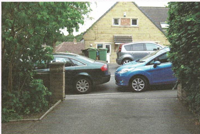
This image was taken near to a school in the Huddersfield area. Only days earlier an ambulance struggled to attend an emergency at that school involving one of the pupils. A seriously ill child failed to change the parking behaviour of these parents. Hopefully pictures like this will never be taken of cars of the parents of Scholes (Elmet) Primary Schoolchildren.

The Parish Council has been in touch with the school and the police about this. The school has already done everything in its power to address this matter but ultimately it's down to parents, please show respect for other people when you park.