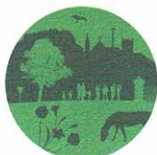
BARWICK IN ELMET & SCHOLES NEIGHBOURHOOD PLAN