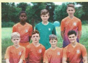
Epworth FC Gala U13's runners-up (lost on penalties)