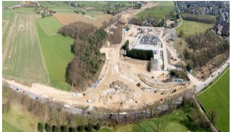
ELOR Drone View of Junction 1 The New A6120 Roundabout Site – April 2021

Once diversions are complete, the earthworks will commence in this area