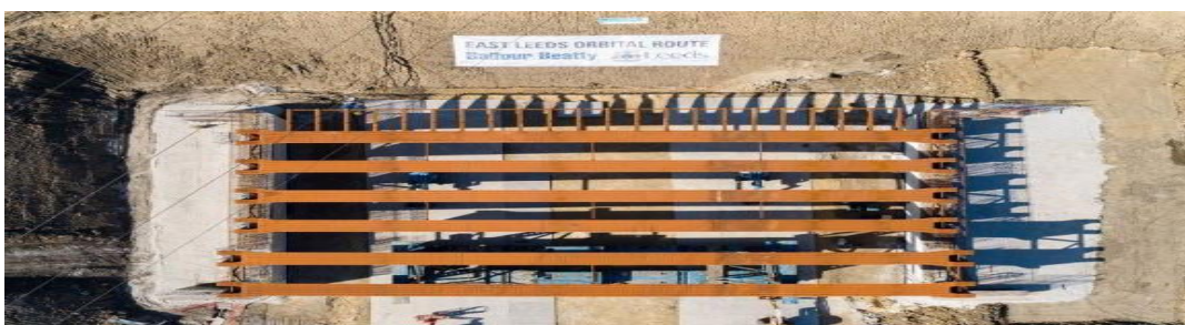
Country Park Underpass - April 2021

The remaining three bridges (all footbridges / NMU bridges) (NMU – means non-motorised users: pedestrians, walkers, cyclists etc!), are at different stages from piling through to construction of the concrete bank-seats, while off site at Sherburn in Elmet, our steel fabricator is busy cutting plate and welding together the components that will make the decks to these three elegant structures.