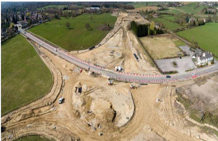
ELOR Drone View of Junction 2 The New A58 Roundabout Site – April -