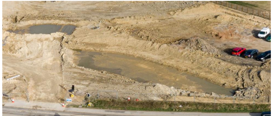
ELORDrone View of the New Leeds (Barwick Road)RoundaboutJunction5–April2021

Utility works will continue in this area.