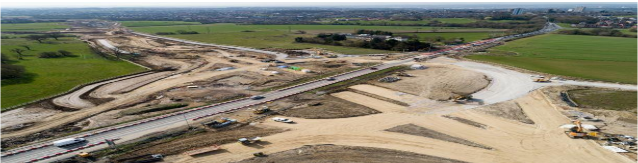
ELOR Drone View of York Road A64 Roundabout - April 2021

Utility works in now complete in this area and ducting works will commence along with the formation of the new carriage way.