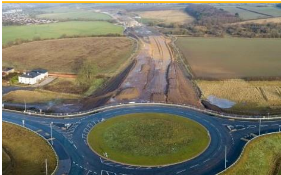
ELOR Drone View of Manston Lane Tie-in Junction 6 – April 2021

Continuation of the work’s 4-way traffic light sequencing will be in operation from Monday - Friday (8am - 8pm) to allow us to move machinery along the length of the project with minimal impact on the local traffic network (The four way lights are to allow material movements within the footprint of the scheme and avoid trafficking through local communities).