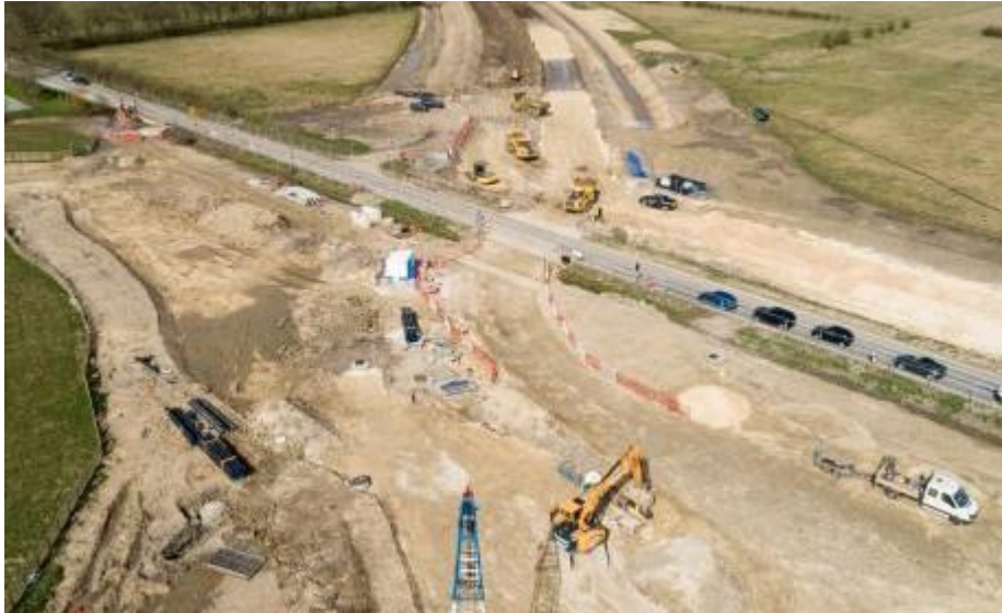
ELOR Drone View of The New Skeltons Lane Roundabout Junction 3 - April 2021