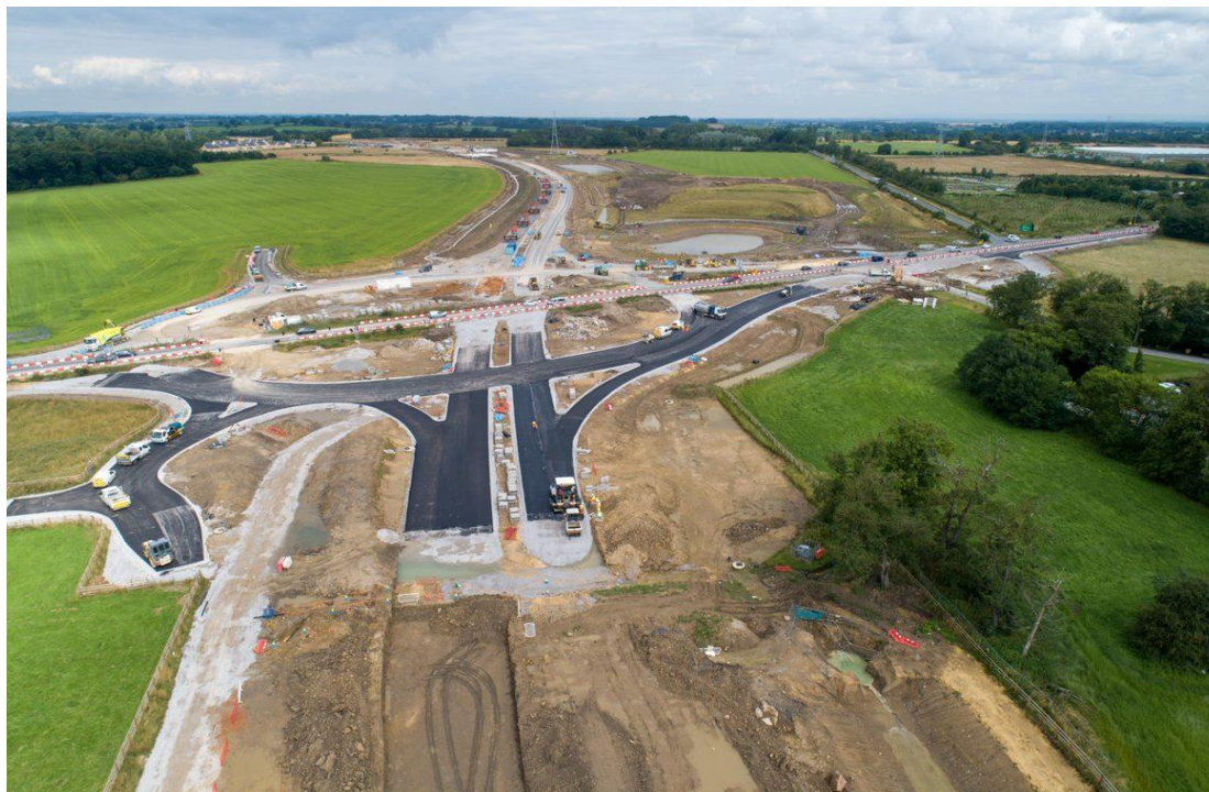
ELOR Drone View of Junction York Road A64 Roundabout – Junction 4

This will immediately be followed by the closure of Thorner Lane at the A64 Junction.