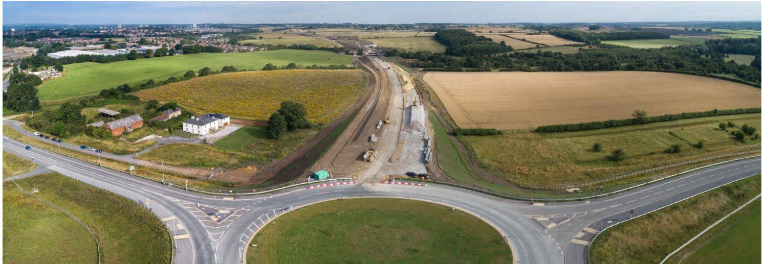
ELOR Drone View of Manston Lane Tie-in: Junction 6

We will soon be recommencing on the earthworks between Leeds Road and Manston Lane.