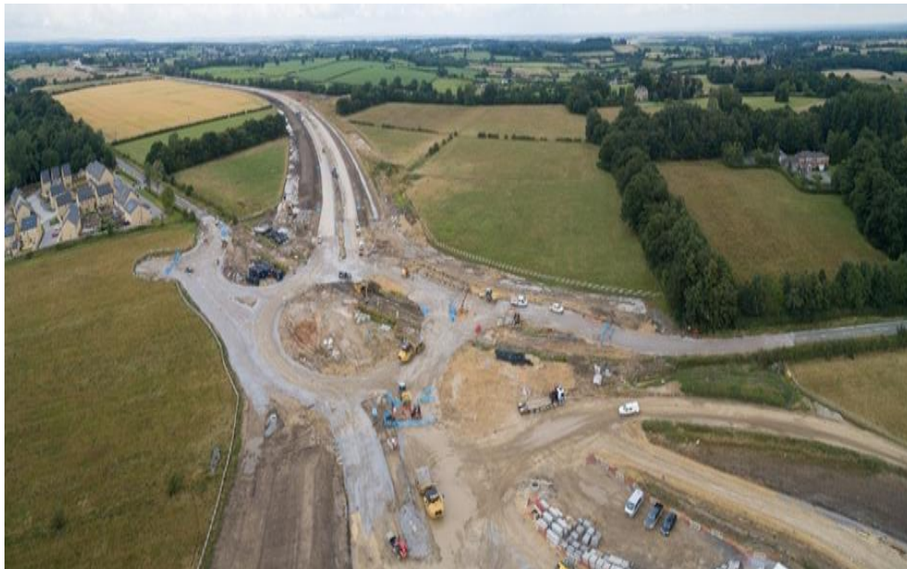
ELOR Drone View of Skeltons Lane Junction 3