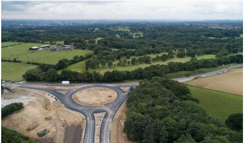
ELOR Drone View of Ring Road, Shadwell, Junction 1

Despite some recent adverse weather progress has gone well on the scheme. We have been able to progress the junctions offline in readiness to divert the traffic onto it to allow us to complete this junction. Image on the right from the recent drone footage showing the junction on the A6120 Ring Road taking shape.