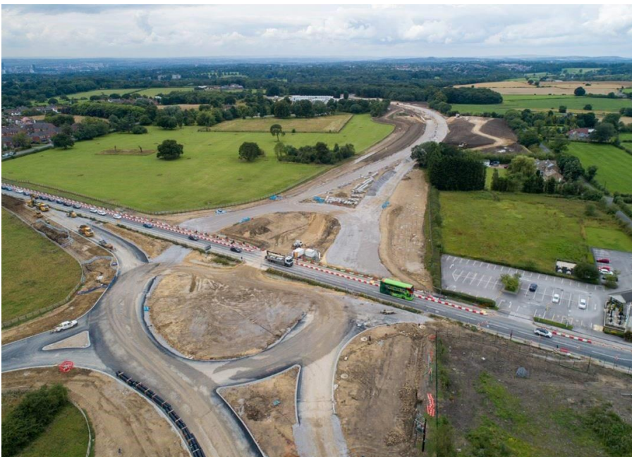
ELOR Drone View of Wetherby Road A58: Junction 2 Skeltons Lane

The temporary four way lights will continue to be in operation to allow the movement of machinery along the length of the project with minimal impact on the local traffic network (The four way lights are to allow material movements within the footprint of the scheme and avoid trafficking through local communities).