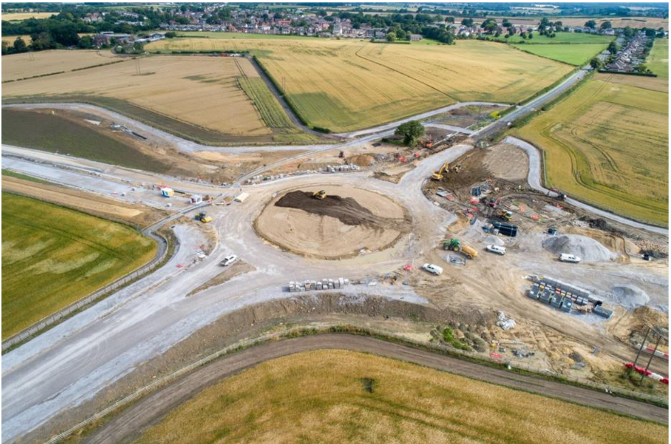
ELOR Drone View of Leeds Road Roundabout: Junction 5

We are pleased to confirm that despite some challenges, Leeds Road will re-open on Monday 6th September at 6.00am as planned. Kerbs are being laid so the junction is starting to take shape. You will start to see the initial layers of surfacing being placed week commencing 23 rd August. The ELOR Project team; Leeds City Council and Balfour Beatty appreciate your patience and support whilst these works have been carried out.