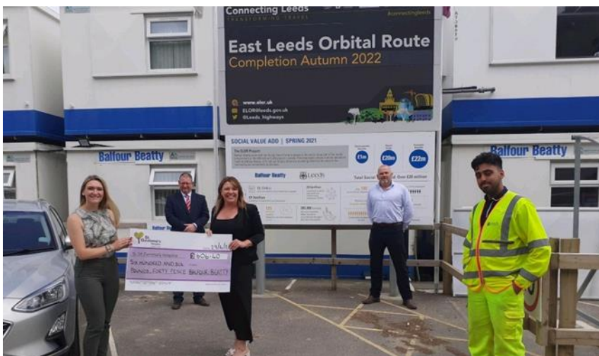
St Gemma's Hospice Cheque Presentation.

Kind support from Local business like this means that more Leeds patients can receive the special care they deserve at the end of life. Find out more about supporting St Gemma Hospice by contacting