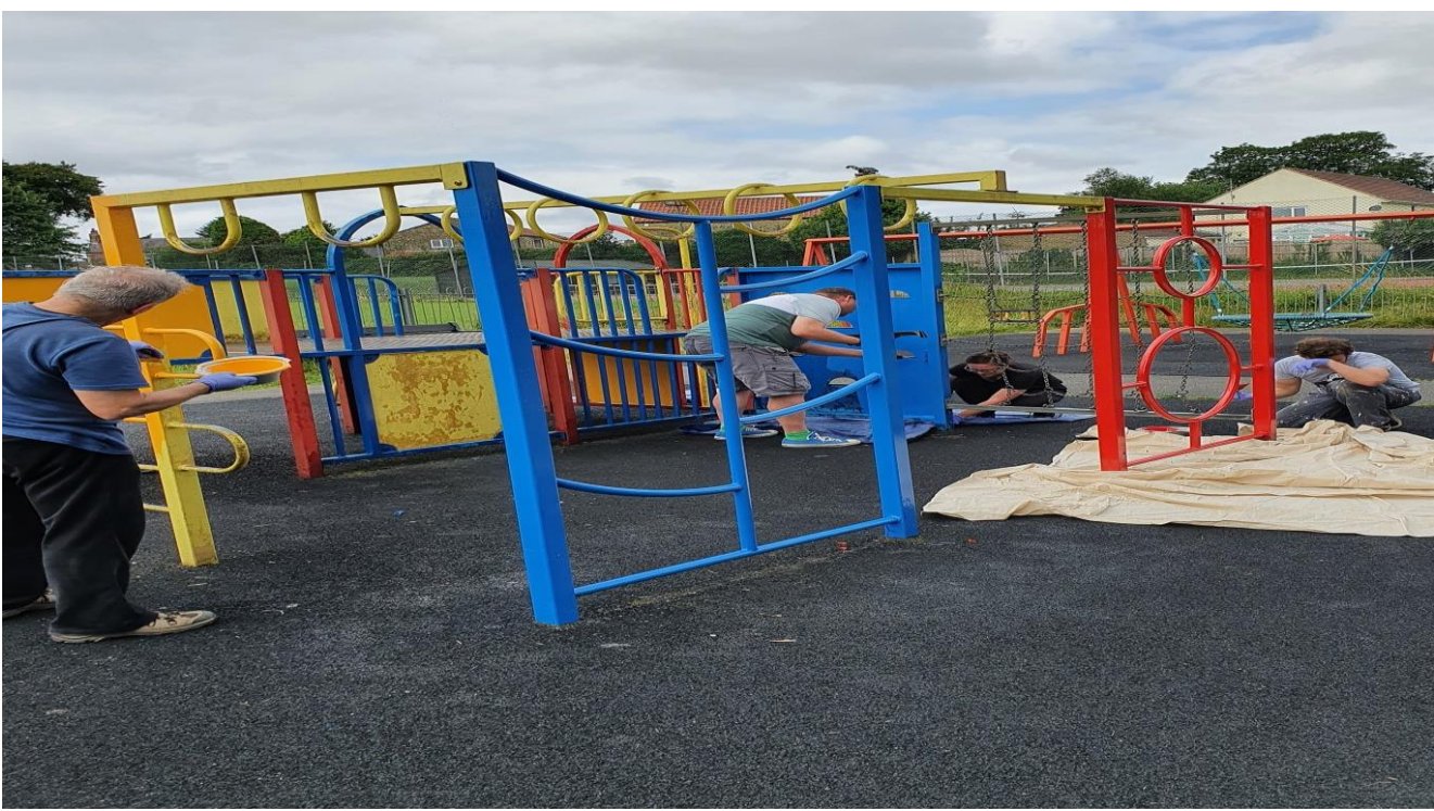
Happy helpers hard at work. Parish activities and facilities.