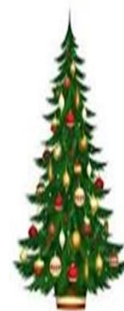
Table Top Sale Christmas Crafts, Gifts Cake stall, Raffle, Tombola, Hand Made Cards